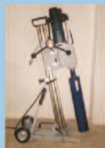
Concrete Core Cutter