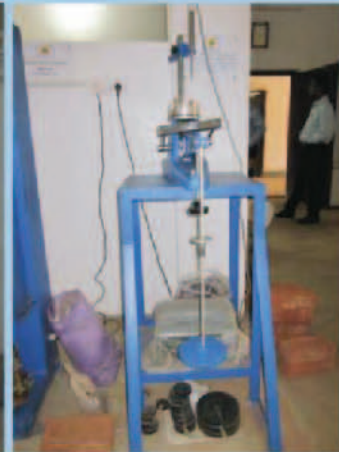
Electronic Consolidation apparatus