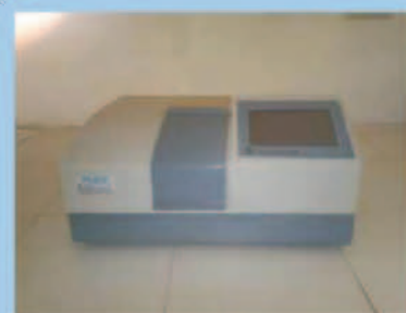
Double Beam UV spectrophotometer