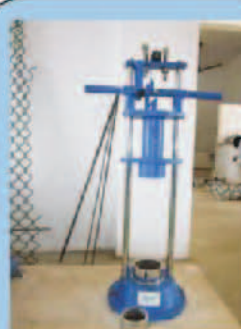
Aggregate Compaction Machine