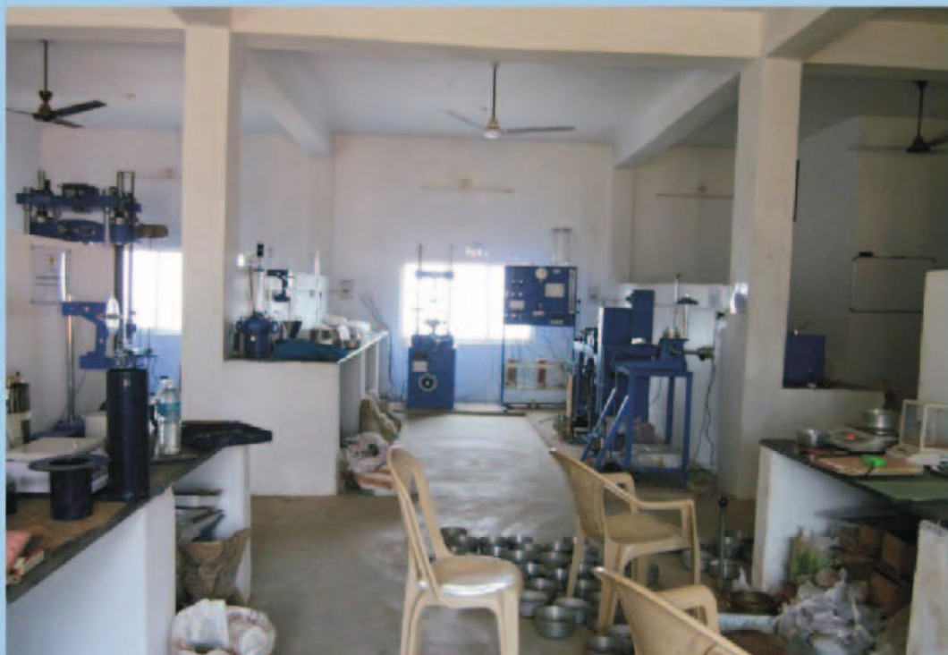
Laboratory Set up II