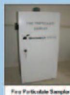
Fine Particulate Sampler

The testing parameters are Ambient Air Quality monitoring as per pollution control board norms. We do SPM 2.5, 10, SOx, NOx and other gaseous parameters.