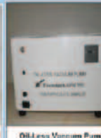
Oil-Less Vacuum Pump