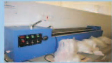
Ductility testing machine