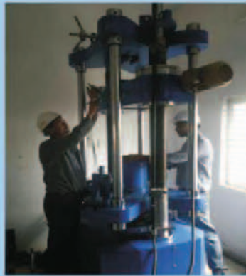
Universal Testing Machine (UTM)