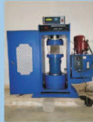
Hydraulic Compression Testing Machine