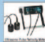
Ultrasonic Pulse Velocity Meter