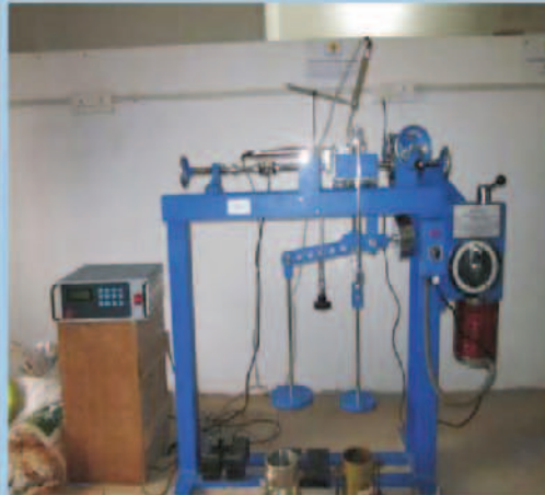
Electronic Direct shear Apparatus