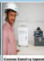
Gaseous Sampling Apparatus