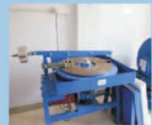
File Abrasion Testing