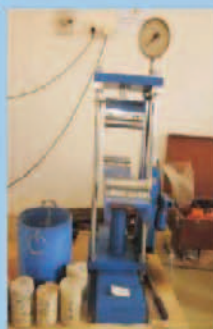
Flexure Testing Machine