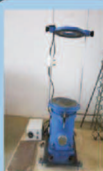
Sieve shaker (Motorised)