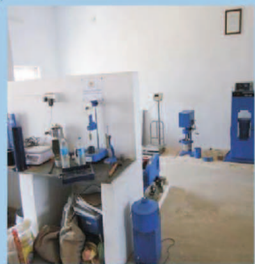
Laboratory Set up I