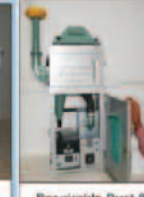
Respirable Dust Sampler