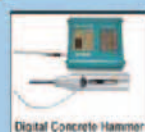
Digital Concrete Hammer