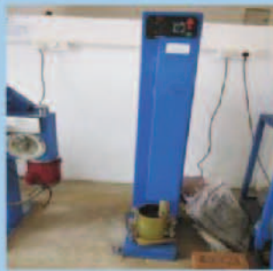
Automatic Soil Compaction