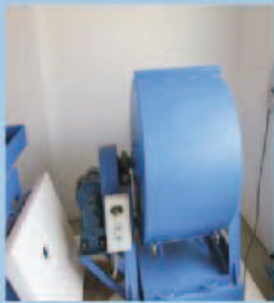
Los Angeles Abrasion